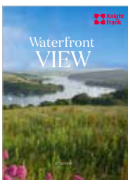
UK Waterfront View 2018 – 2018