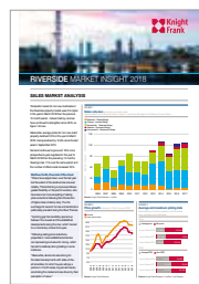
London Riverside Market Insight – 2018