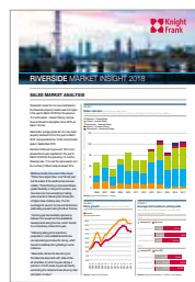
London Riverside Market Insight – 2018