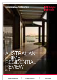
Australian Prime Residential Review – 2018