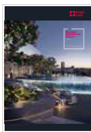
Global Branded Residences – 2019